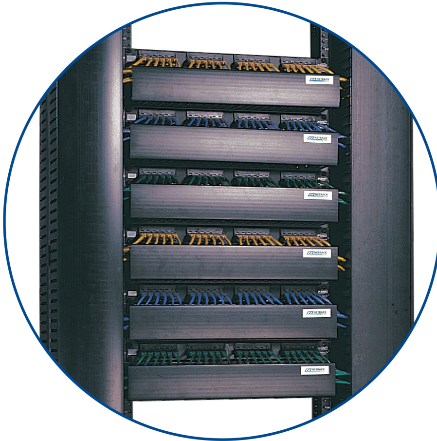
Vertical Cable Organizer

Standard configuration will be 4 Inch, 6 Inch, with cover on front or front & back and bracket for mounting on rack. Available in Front or Front & Back Variants.