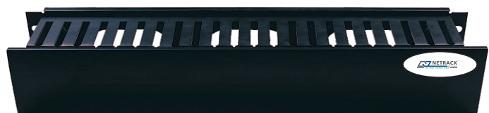
Horizontal Cable Organizer/2U/Chanel on Front