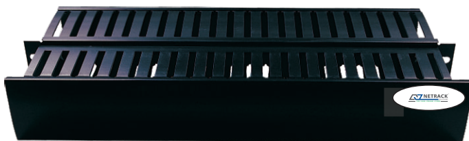
Horizontal Cable Organizer/2U/Chanel on Front & Back